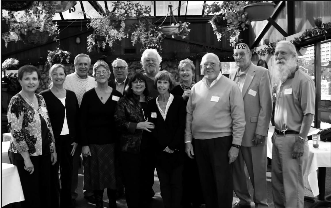
OLPH Class of 1956

You've heard of 10 year Reunions, Silver and Golden Anniversaries, but do you know what a "Heinz Reunion" is? Referring to the famous Heinz Brand name, it means 57 years graduated. This summer the OLPH Class of '56 celebrated at Sinbad's Restaurant in San Francisco.