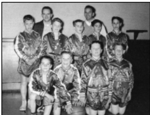
1957 "90's" BASKETBALL TEAM